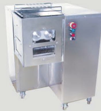
■ QSX800II 鲜肉切丝机