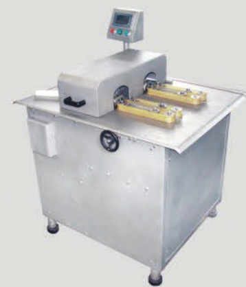
■ ZXJ-II 扎线机